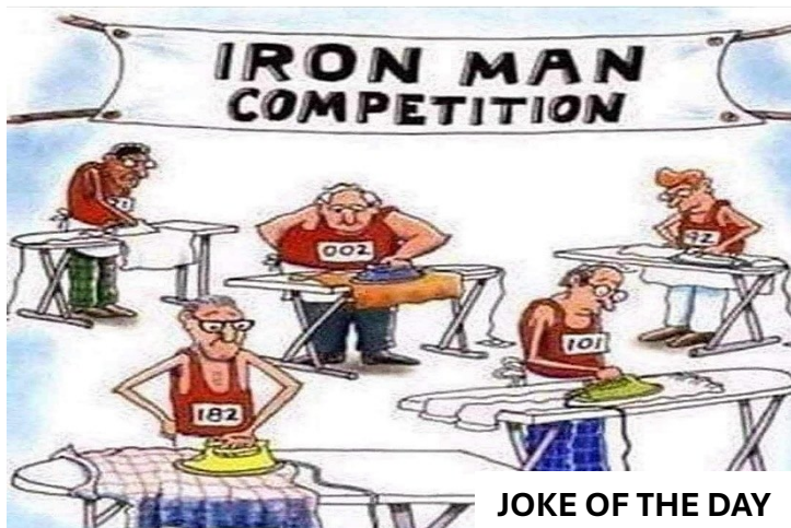
JOKE OF THE DAY