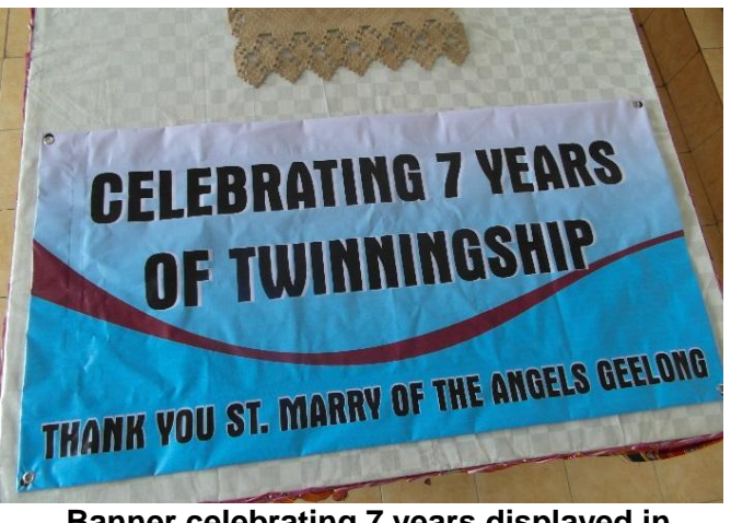
Banner celebrating 7 years displayed in Viqueque